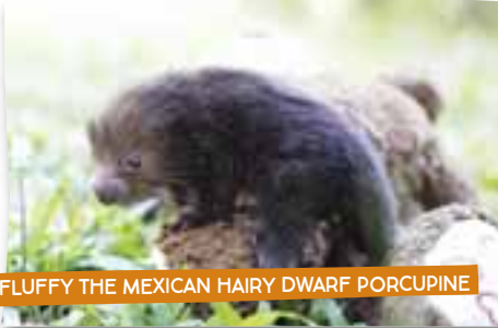
FLUFFY THE MEXICAN HAIRY DWARF PORCUPINE