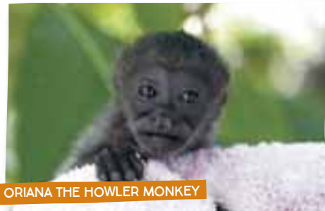
ORIANA THE HOWLER MONKEY

And let's not forget the Mexican hairy dwarf porcupine with his big dark eyes and stubby nose; the painted wood turtle, the keel billed toucan and the black-bellied whistling duck, to name a few