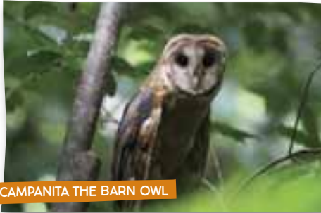
CAMPANITA THE BARN OWL